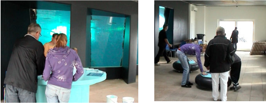
Fig. 4. (A) The girl creating wish with her father and (B) using the Hydrosopes with her brother

C). After having watched the aquarium for a few moments, the rest of her family enters the room, and her father begins to construct a fish at the construction table. The girl immediately joins her father, and they collaborate on building a new fish. As her father is apparently using the installation for the first time, on several occasions the girl instructs her father on how the installation works (Fig. 4, A). After a few moments, her attention turns to her mother and her younger brother, who are exploring the digital ocean through one of the Hydrosopes. She walks to the Hydrosopes, and spends time moving one of these around with her brother (Fig. 4, B), before returning to the large aquarium windows.