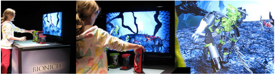
Fig. 6. The LEGO table