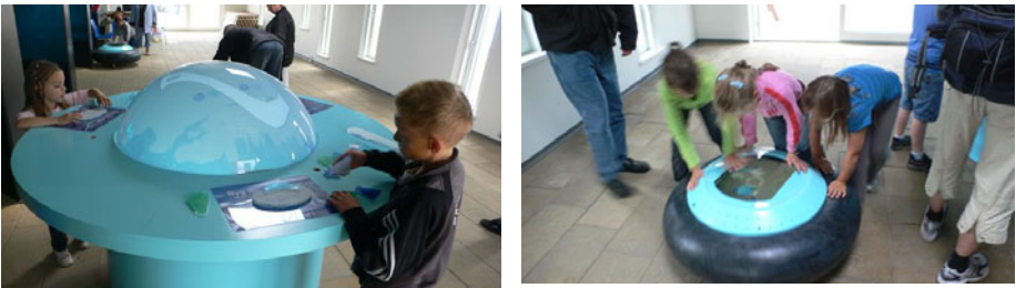
Fig. 2. (A) Visitors constructing fish based on a physical construction kit and (B) exploring the virtual ocean using the Hydrosopes (right)

Our second case derives from our work in the Interactive Experience Environments (IXP) project, aimed at exploring novel interactive installations for museums and science centres. Specifically, we focus on a prototype designed for the Kattegat Centre, which is a marine centre displaying marine life from all over the world. The centre is primarily composed of large aquaria with glass sides that allow visitors to explore the variety of marine life. As part of our research efforts, we designed a prototype installation for the centre, where visitors were invited to construct fish for a virtual ocean. Fish were constructed using a physical construction kit with embedded