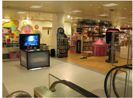
Fig. 7. (A) The matching base profiles (B). The LEGO Table at the department store

The LEGO Table was in operation for a four-week period at a Danish department store. During this period, the interactive table was located in one of the main corridors, and the fact that the table faced the top of the ascending escalator facilitated easy access to the table (Fig. 7, B). During one busy shopping Saturday, activities around the interaction table were video-recorded. The initial analysis reveal that a total of 124 people were observed interacting with the table and in the six hours of observation data form the use of the LEGO table we identified 94 interactions ranging from six seconds to 25 minutes in length, see [27]. An analysis of the distribution of gender and age shows that a wide variety of people engaged in the interaction, though most were boys less than 16 years of age. The following two situations are from that particular day. The first situation represents a dynamic instance of engaging interaction including aspects of physical tangibility and social relations, whereas the second situation revolves around dynamic aspects of physicality and content.