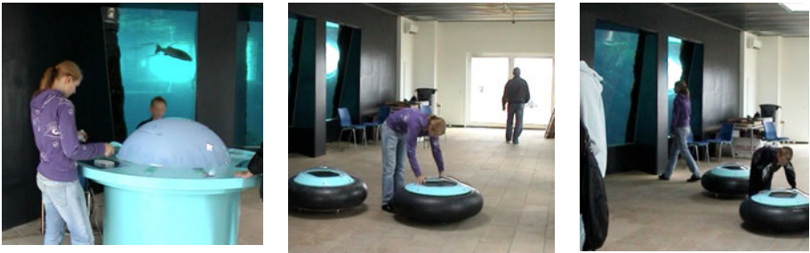
Fig. 3. (A) The girl moving between the construction table, (B) the Hydrosopes and (C) the large aquarium

The Hydroscope installation was placed next to a series of large windows that provide a view into one of the larger aquaria of the marine centre. The three images in Figure 3 are snapshots of a sequence in which a user moves (the girl in the purple sweater) between the Hydrosopes installation and the large windows.