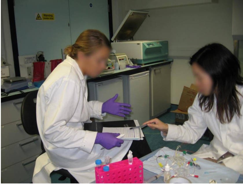
Figure 1: Sensor Specialist (on Left) Discussing With Bioengineer (on Right) Over the Sensors (Disposed on Table)