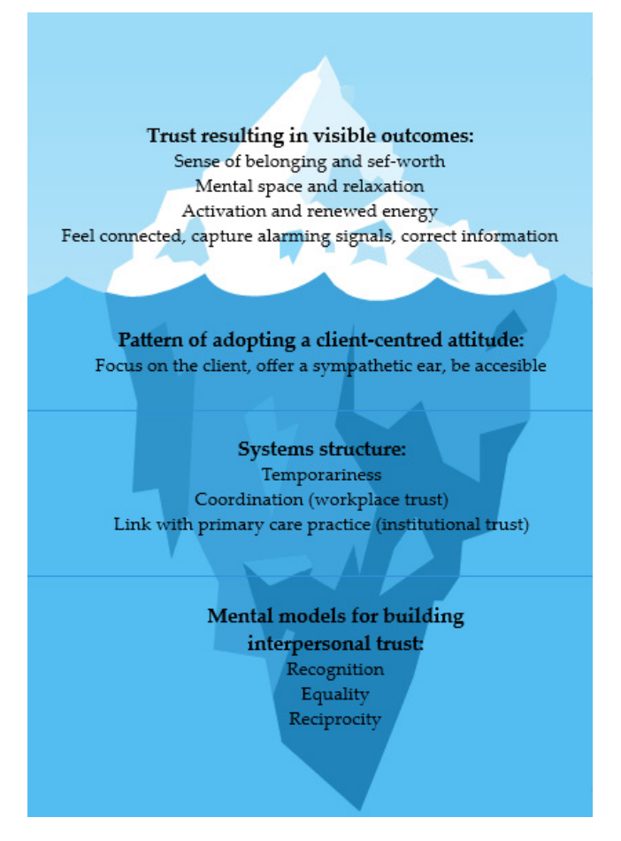
Figure 3. Program theory presented in the iceberg model.

and by their professional caregivers. More specifically, the link with primary care practice is an important facilitator for a trustful relationship to evolve between CHWs and clients. As well as for CHWs as for clients, this link appears to build trust that the right people for the right reasons are referred to the CHWs.