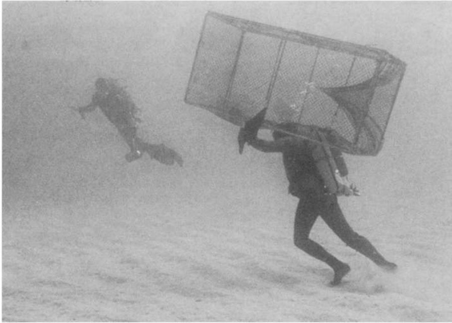
Fig. 2: Underwater view of flexible tunneled experimental trap being moved to a new site

plastic bags. During the third study, small grunts captured in one trap were removed to rigid wire-meshed boxes and used as live bait in other traps. Bait was sometimes left free in the trap where it could be eaten. Some tests were conducted with unbaited traps.