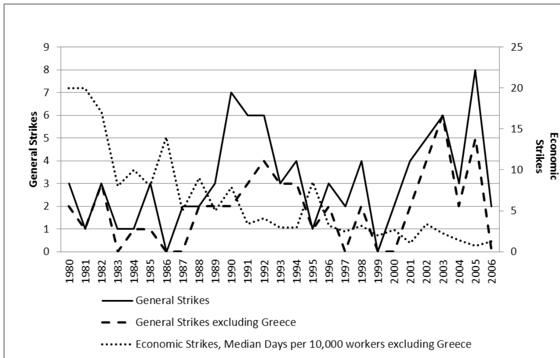
Figure 1. General and Economic Strikes in Western Europe, 1980-2006

Note: General strikes are reported for the EU15 plus Norway; economic strikes are reported for Norway and the EU15 but exclude Belgium, Greece, and Luxembourg. Consistent strike time series are not available for these countries because of long gaps in data in the 1980s (Belgium and Luxembourg) and since the early 1990s (Greece).