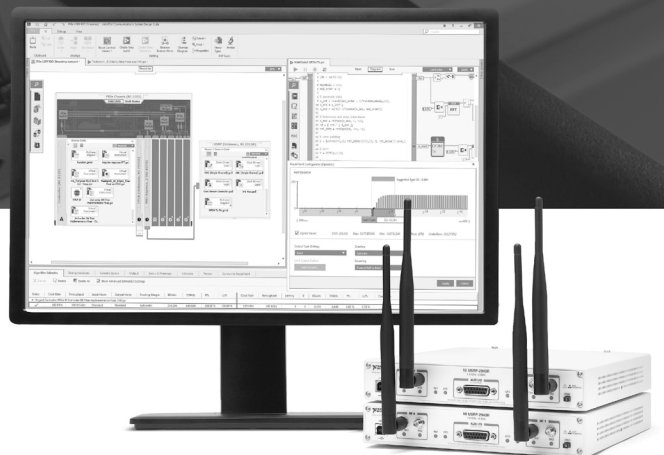
LabVIEW Communications System Design Software, USRP-2943R SDR Hardware