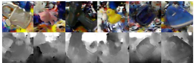
(b) Examples generated by our model, trained on Linemod.