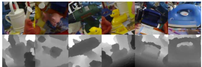
(a) Image examples from the Linemod dataset.