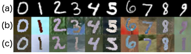
Figure 3. Visualization of our model’s ability to generate samples when trained to adapt MNIST to MNIST-M. (a) Source images \mathbf{x}^s from MNIST; (b) The samples adapted with our model G(\mathbf{x}^s, \mathbf{z}) with random noise \mathbf{z} ; (c) The nearest neighbors in the MNIST-M training set of the generated samples in the middle row. Differences between the middle and bottom rows suggest that the model is not memorizing the target dataset.

mask \mathbf{m} \in \mathbb{R}^k , our masked-PMSE loss is: