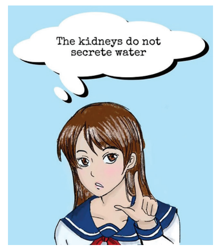
Fig. 4: Miss Take and renal water handling

The units of parameters are important to take note of. The word "clearance" can give the idea that a certain amount of the solute is cleared in the urine. The renal clearance concept actually refers to the imaginary volume of plasma that has been cleared of that solute that is found in the urine. So for glucose that is filtered and completely recycled back into the blood, no theoretical volume of plasma has been cleared of glucose. The glucose renal clearance is zero volume (of plasma) per time (mL/min).