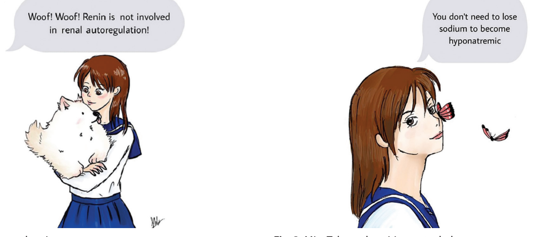
Fig. 2: Miss Take and renin

If the hyponatremia in this normal case of positive water balance stimulates directly or indirectly via renin, an increase in aldosterone level, an illogical consequence, positive sodium balance will result (Fig. 3).