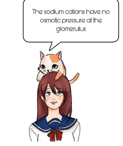
Fig. 1: Miss Take and glomerular oncotic pressure

Physiology definitions (I coined the term "DePHYnation") are essential to describe physiology accurately. The renal autoregulation of RBF also autoregulates GFR. Autoregualtion of GFR will then control the filtered solute load given by GFR x P#, where P# is the plasma concentration of filterable solute #. As in the cerebral and coronary vasculatures, autoregualtion of blood flow is the maintenance of a relatively constant organ perfusion over a certain physiological range of blood pressure fluctuations.