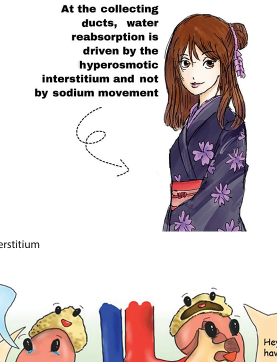
Fig. 5: Miss Take and hyperosmotic renal interstitium