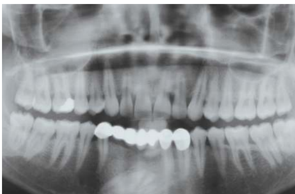
Figure 5. Transmigrated mandibular right canine is impacted with some incisor teeth.