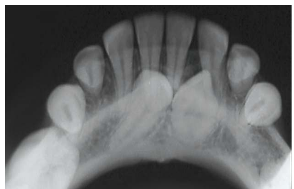
Figure 4. Occlusal radiograph showing bilaterally impacted canines in vertical position.