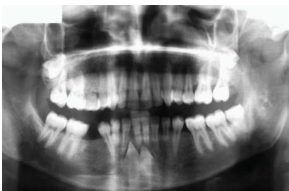
Figure 3. Bilaterally impacted canines located below the apices of the incisors in vertical position.