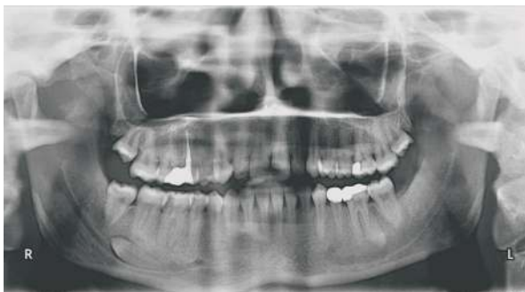
Figure 1. Panoramic radiograph showing transmigrated left canine extending from left side to opposite side and located below the apices of the right mandibular second molar.

While most of the transmigrated mandibular canines occurred unilaterally, 1,2,4,5,7,9,11,17,19 only 9% of them were bilateral. 1,6 Although most of the bilateral transmigrated canines lied horizontally,