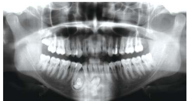
Figure 2. Radiograph showing impacted right mandibular canine tooth is associated with compound odontoma.