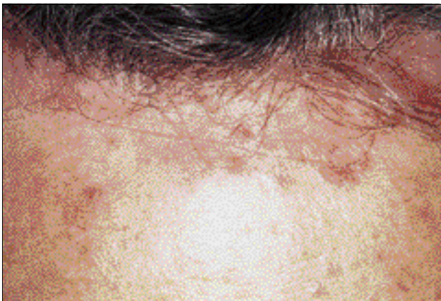
Figure 1: Psoriatic lesions on the patient's scalp. The patient's cutaneous lesions presented as silvery scales.

In 1997, Younai and Phelan 8 reviewed the literature and presented a case of oral mucositis with features of psoriasis. Their