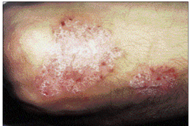
Figure 2: Psoriatic lesions on the patient's elbow.