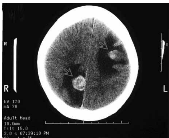
Figure 1. Brain metastasis (Case 1).

presumptive diagnosis of encephalitis and symptoms of convulsion, unconsciousness and left-sided paralysis in November 2002. A week prior to admission she had been complaining of severe headache, nausea, vomiting and convulsion. On admission the chest X-ray and other usual imaging studies were normal. She had a history of stillbirth about a year prior to admission and amenorrhea for 3 months. The pregnancy test was positive but the sonography did not show gestational sac. During admission she developed vaginal bleeding and the \beta hCG level was 1300 mIU/ml. A probable encephalitis induced abortion was considered. Two days later \beta hCG was reported as 17560 mIU/ml. She developed neurological symptoms such as urinary incontinence and limitation in movement. Abdominal and brain CT-Scan was performed which showed multiple metastatic lesions in brain figure 1. She was transferred to gynecologic oncology department for further management. With diagnosis of metastatic GTN, she was started on chemotherapy. After the first course, multi-agent chemotherapy, she was treated