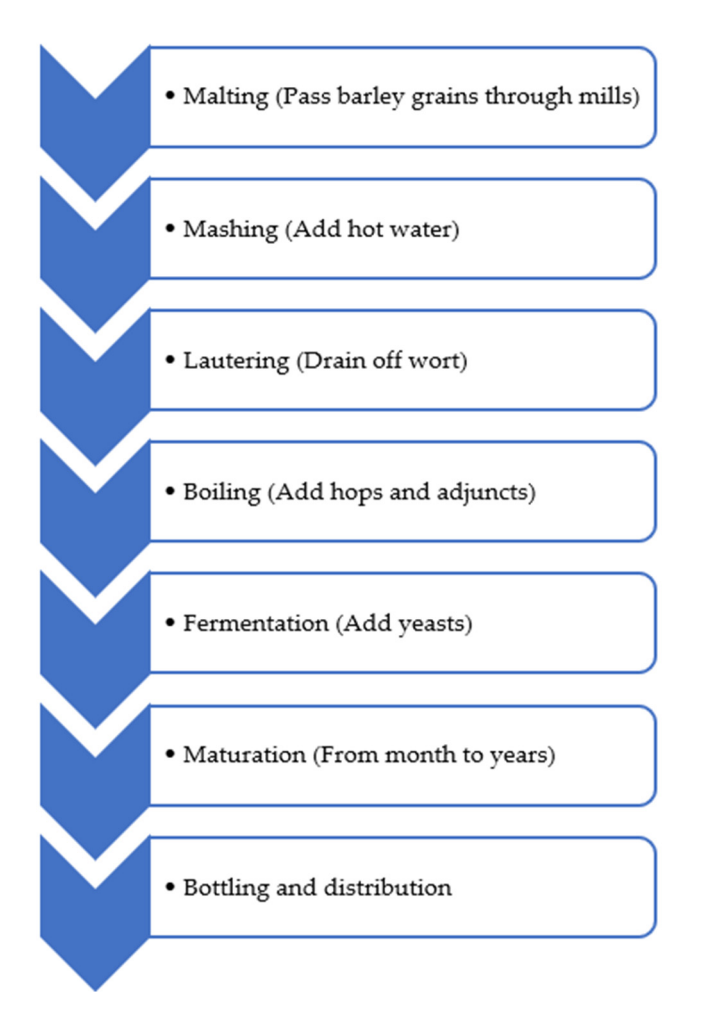
Figure 2. Main steps required for beer production.

alcohol, cold maceration of fruits or flowers with distilled alcohol, or distillation of alcohol and flavoring agents. Various industrial and homemade liqueurs made from fruits, herbs, coffee, honey, and milk were analyzed by Cunha et al. (2017) [43] for BA presence. The coffee liqueurs showed the highest total content (2.1 mg/L), followed by honey liqueurs (1.9 mg/L), fruit liqueurs (1.3 mg/L), and herb liqueurs (1.0 mg/L). A significant difference was observed between BA concentrations in industrial and homemade liqueurs from fruits and herbs, and the latter showed a higher content. Ethylamine, morpholine, and cadaverine were found in all samples, while another six BAs (methylamine, dimethylamine, 1,3-diaminopropane, putrescine, histamine, and tyramine) were found in more than 50% of the investigated liqueurs.