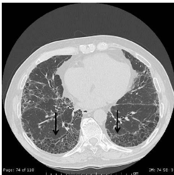
Figure 1 High-resolution computed tomography image demonstrating usual interstitial pneumonia pattern, with bilateral, basal, and subpleural predominant reticular abnormality and honeycombing (arrows).

found in several clinical settings, including collagen vascular disease, drug toxicity, chronic hypersensitivity pneumonitis, asbestosis, familial IPF, and Hermansky-Pudlak syndrome. 1 Therefore, the diagnosis of IPF requires exclusion of all known causes of fibrotic interstitial pneumonia.