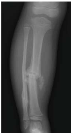
FIGURE 4: Hypertrophic bone callus.