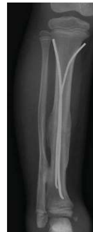
FIGURE 5: Complete radiological consolidation of the tibia fracture was achieved five months after the surgery.

demineralization. Surgical fracture repair allows for early weight bearing, diminishing the risk of further osteopenia, which is also usually present in these patients as a part of their associated neurogenic arthropathy (Figure 3) [21].