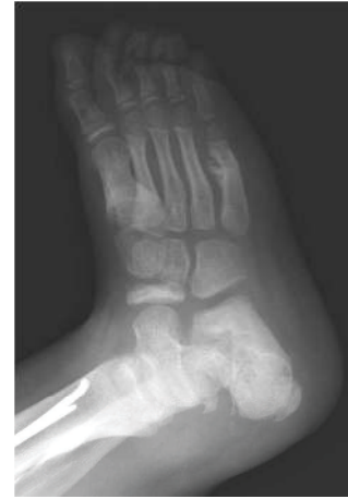
FIGURE 1: Navicular avascular necrosis and fifth metatarsal fracture in the right foot with hypertrophic bone callus.

At 5 years of follow-up, patient has progressed.