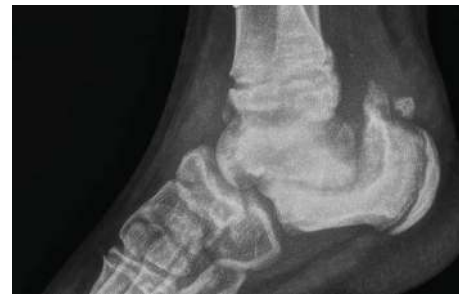
FIGURE 2: Demineralized bones and generalized osseous destruction.