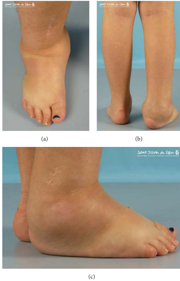
FIGURE 3: Lower limb edema.