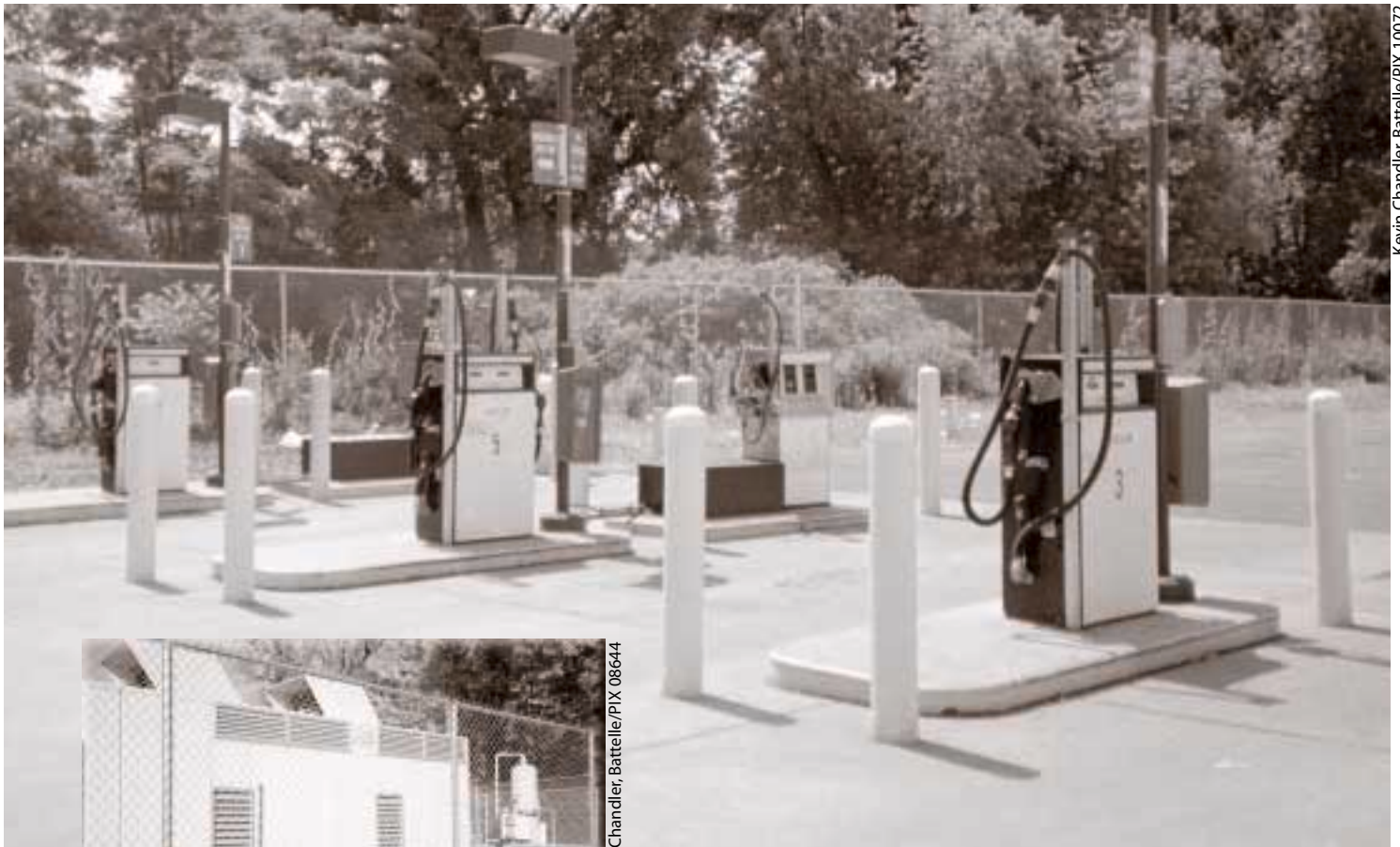
Kevin Chandler, Battelle/PIX 10072