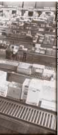
United Parcel Service/PIX 09807