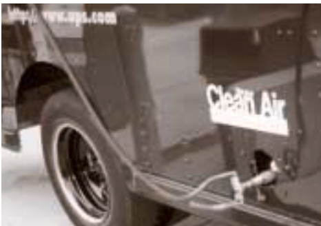
Refueling at a CNG station is similar to using gasoline pumps.