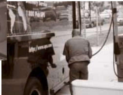
United Parcel Service/PIX 07055