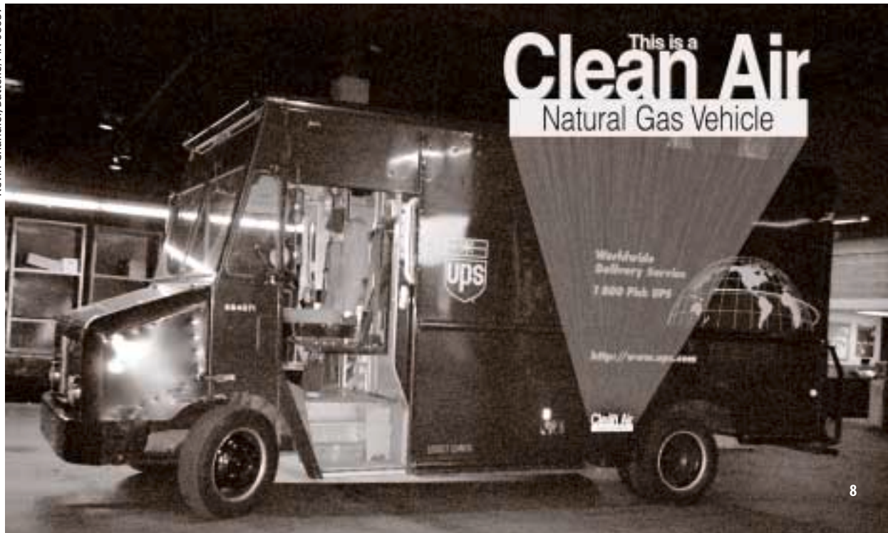
UPS package delivery cars using CNG display their commitment to clean air with this logo on the vehicles.