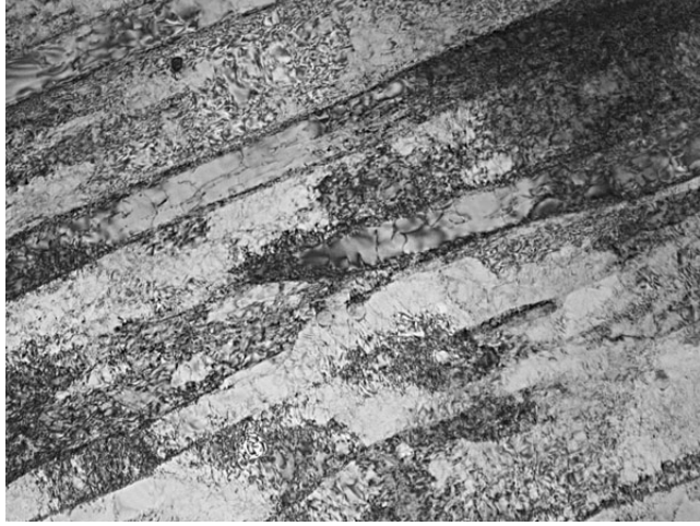
FIGURE 1. Typical dislocation band structures. Courtesy of © Fraunhofer IWS Dresden, Germany [IWS14].