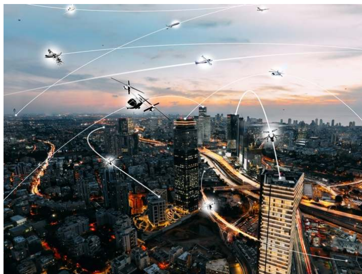
Fig. 1 Conceptual illustration of Urban Air Mobility operations.

It is expected that the earliest UAM operations of the future will be for demonstration purposes and will be required to comply with current airspace rules and regulations. It is anticipated that they will be very similar to (if not the same as) current VFR operations. Furthermore, it is expected that these initial UAM flights will be conducted by human pilots on board the UAM aircraft at all times and will have ATC providing services as in current operations. However, a number of organizations are pursuing UAM concepts that span the range of possible roles and responsibilities for humans and autonomous systems. For instance, some UAM aircraft manufacturers are working on developing vehicles that would not require a human pilot on board. These aircraft would instead be piloted remotely by some combination of humans on the ground, autonomous systems on the ground, and/or autonomous systems in the air on board the aircraft.