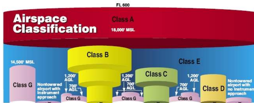
Fig. 2 Airspace classification.

On the other hand, for metropolitan areas that are located near airports, UAM operations may be conducted entirely within Class B airspace around major airports, Class C airspace around medium-sized airports, or Class D airspace around smaller airports. For example, downtown Dallas lies entirely within Class B airspace due to its proximity to Dallas-Fort Worth airport. The extent to which UAM operations would be allowed to occur in these classes of airspace would depend on the departure location, arrival location, and/or constraining factors (e.g., noise restrictions and obstacles). Under present-day rules, UAM flights would be required to communicate with ATC prior to entering Class B, C, or D airspace.