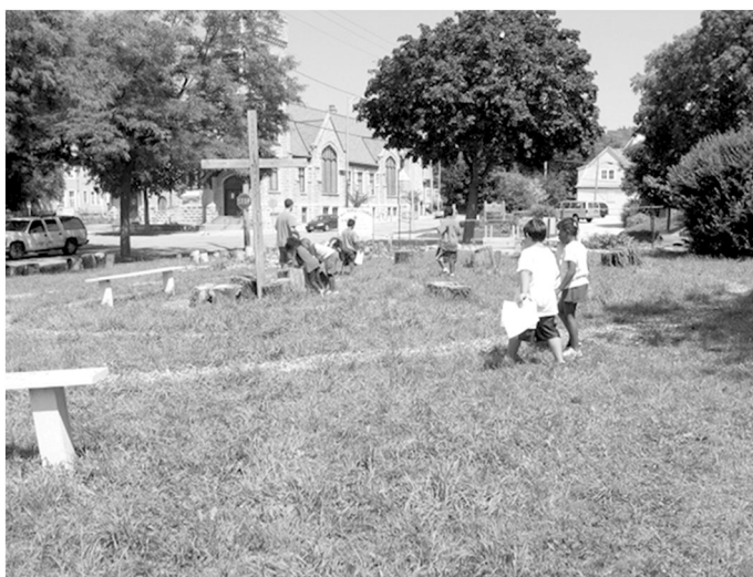
Figure 2: Children participate in a lesson at All People's Garden, July 2010

The first garden in Harambee was founded in 1992 by the neighborhood's All People's Church to provide educational space for the church's youth programs. The church maintained All People's Garden with an annual permit from the City of Milwaukee until 2005, when the city revoked the permit and evicted the garden with intent to commercially develop the land. This goal never materialized and the former garden became an abandoned space. In 2008, residents led by All People's Church reclaimed the space and rebuilt the garden. Church members added a cross to the rebuilt garden to reflect its importance as a religious space for church members (see Figure 2). All People's pastor conceives the rebuilding of the garden as "an act of civil disobedience" proclaiming "that we are not going to let the city call this a vacant lot" (personal communication). 1 The City eventually acknowledged this status by providing a new permit for gardening, and the garden thrives once again. By reclaiming control over the space and returning it to its original use and