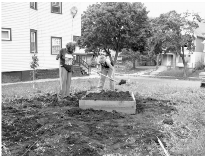
Figure 3: Volunteers build raised beds at Grow and Play Garden, June 2010

Harambee gardens provide opportunities for resident leadership and decision-making, as their development has depended largely on the leadership and participation of citizen volunteers, who are mostly neighborhood residents (see Table 1). Volunteers decide how to assign responsibility for garden work, what to plant in garden beds, and how to distribute garden produce. Volunteers organize workdays, transport garden tools, raise funds, and perform regular maintenance tasks, such as shoveling snow and mowing grass. Nigella Commons Garden, for example, is led by two female residents, who write grant applications to solicit funding, store tools at their homes, and organize regular group workdays at the garden. All People’s Garden is deeply rooted in the neighborhood, as the church and garden are an established neighborhood community site where residents interact. Participation and leadership in the development of gardens represents an important step for Harambee citizens in gaining control of their built landscape and engaging in localized political activities.