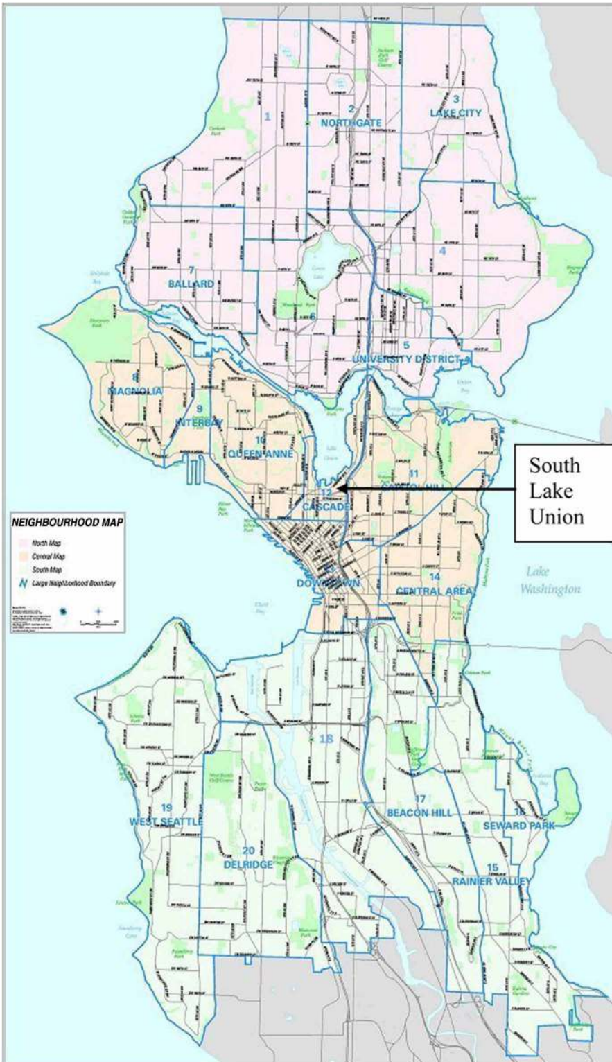
Figure 1. Seattle and South Lake Union.