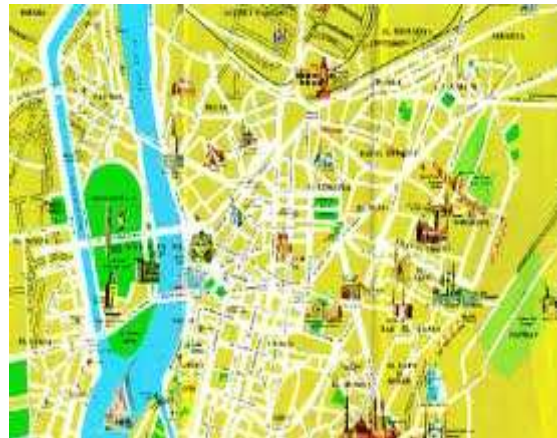
Figure 2: Cairo 2018 Draft City Plan (Egypt State Information Service, 2009)