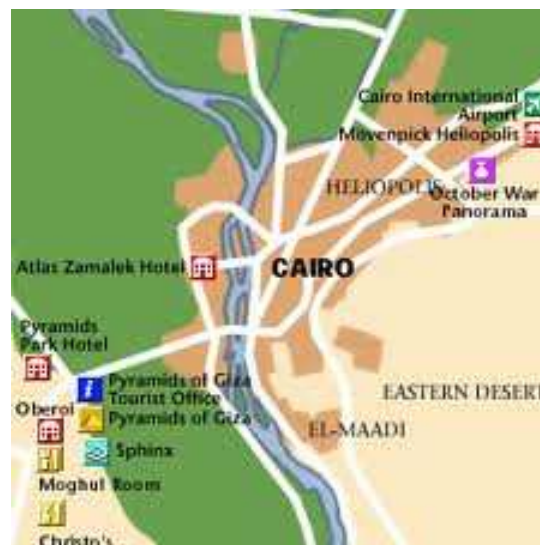
Figure 1: Cairo city-regions and strategic zones