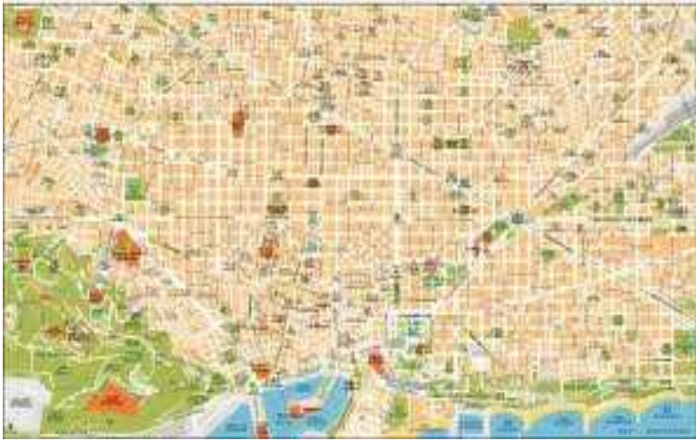
Figure 4: Amman 2025 Draft Plan (Greater Amman Municipality, 2009)