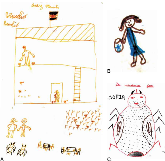
Fig. 4: draws made by Bolivian children related to triatomine knowledge.

a: significant differences (p < 0.05) between South and North zones. b: IHA and ELISA.