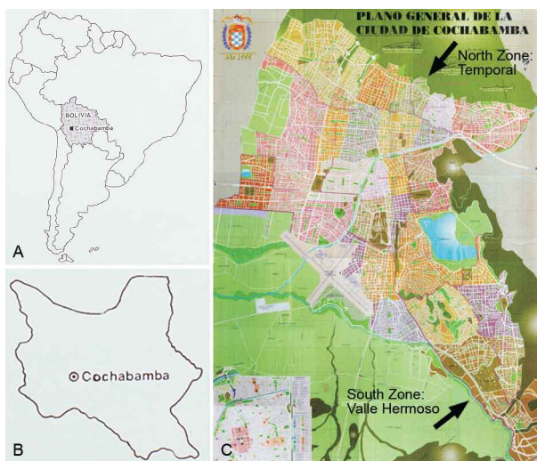
Fig. 1: map of South America (A), showing the location of Bolivia, department and city of Cochabamba (B) and the two studied areas (C) of Valle Hermoso and Temporal, in the South and North zones, respectively.

Serology with IHA and direct enzyme-linked immunosorbent assay (ELISA) - IHA was performed using a commercially available diagnostic kit (Polychaco, Buenos Aires, Argentina). The serum was diluted 1/16, 1/32, and 1/64, and positive and negative controls were employed for all test plates. This assay was also used to analyze the dog serum samples. ELISA was performed using a commercial available kit (Chagastest, Buenos Aires, Argentina) and as with the IHA analysis, positive and negative controls provided in the kit were used with all samples.