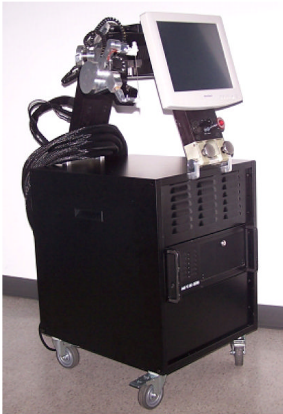
Figure 2. Revolving Needle Driver on the AcuBot robot