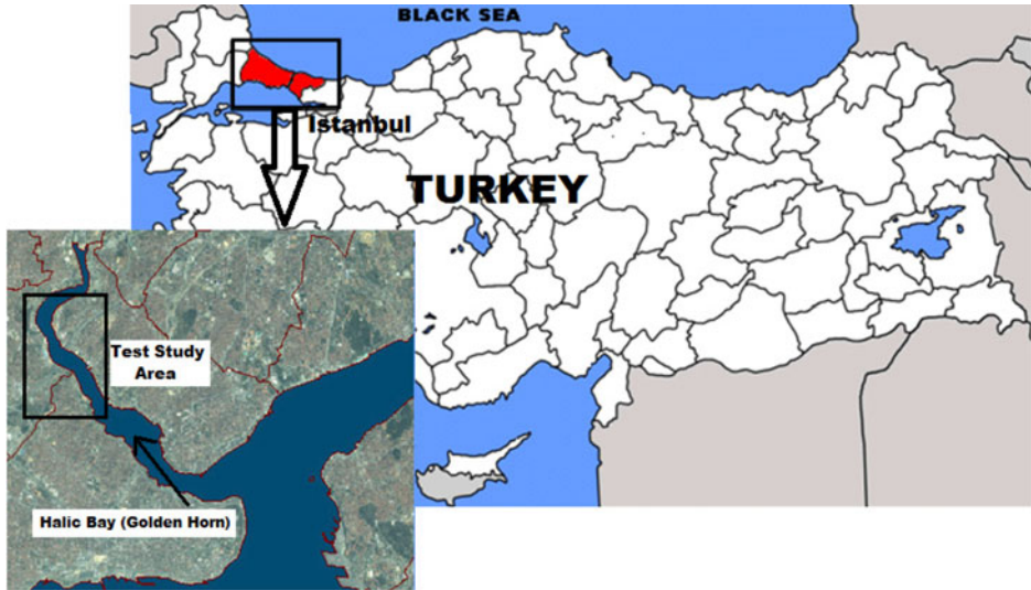
Figure 1. Location of the Test Study Area, Golden Horn, Istanbul.