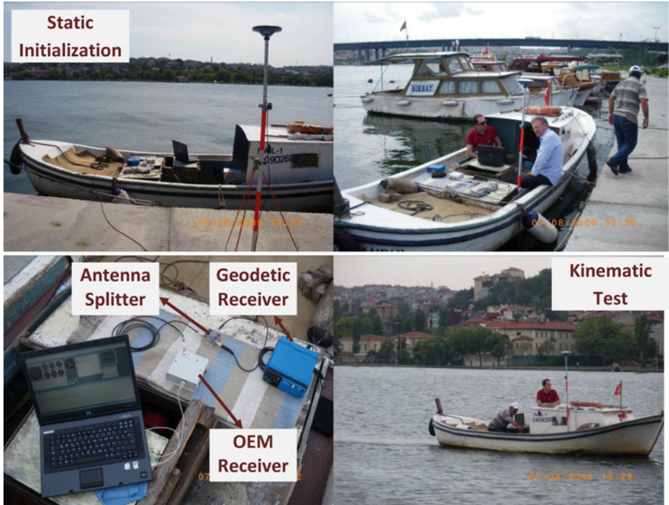
Figure 3. Kinematic Test in the Study Area.