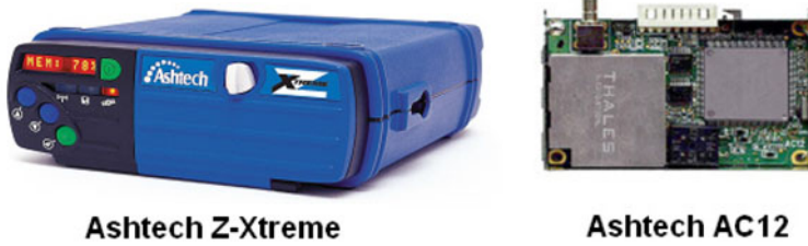
Figure 2. Geodetic-grade receiver ( left ) and OEM receiver ( right ) used in this study.