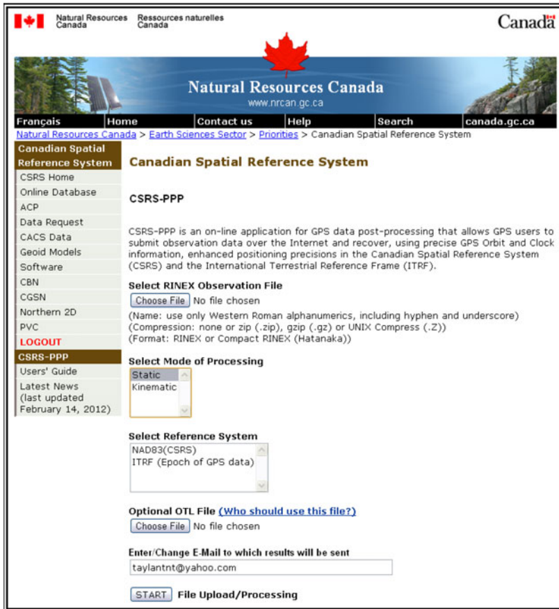
Figure 5. Online CSRS-PPP Service Web Site (as of June, 2012) ( http://www.geod.nrcan.gc.ca/online_data_e.php ).

5. RESULTS AND DISCUSSION. In this study, the performance of the Precise Point Positioning (PPP) technique in marine applications was investigated using geodetic-grade and OEM GPS receivers through the online Canadian Spatial Reference System (CSRS)-PPP service. After the evaluation of the data obtained from the dual frequency receiver, centimetre to decimetre level position accuracies were achieved. Results obtained from the low-cost single frequency OEM GPS receiver were converged to the relative technique within metre-level accuracy. It was found that the obtained accuracy is good enough for many studies including hydrographical surveys, marine geodesy, navigation and oceanography.