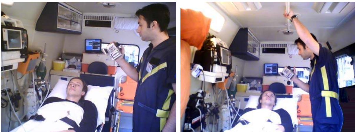
Fig. 2 Operation of the system: the camera is transmitting video to the laptop computer that in its turn uses the PCMCIA card to transmit through a 3G link.

As there had to be some kind of network performance indicator, on the mobile side of the system, two network monitoring programmes were running continuously: one was provided with the PCMCIA card and indicated the network connection (UMTS or 3G) and the speed connected, while the other displayed information on channel utilisation, packet size, protocol usage and specific speed on every instant.