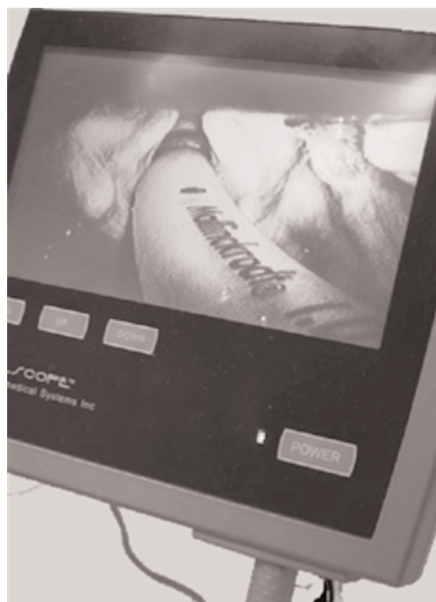
FIGURE 2 This is a typical view seen on the LCD monitor – not that of the patient described in this report. It illustrates the endotracheal tube passing through the larynx. Complete control throughout tube insertion can be achieved.

Seven months later, the patient presented for repeat cystoscopic bladder tumour resection. He professed a lack of awareness of any prior anesthetic problems. On examination, he had a normal interincisor gap, thyromental distance, cervical range of motion and a class II Mallampati view. 5 He declined the recommendation of awake fiberoptic intubation but agreed to this if laryngoscopy or fiberoptic intubation following induction proved unsuccessful. Sodium citrate was administered and anesthesia was induced with fentanyl, propofol and succinylcholine following preoxygenation. Cricoid pressure was maintained and a videolaryngoscope