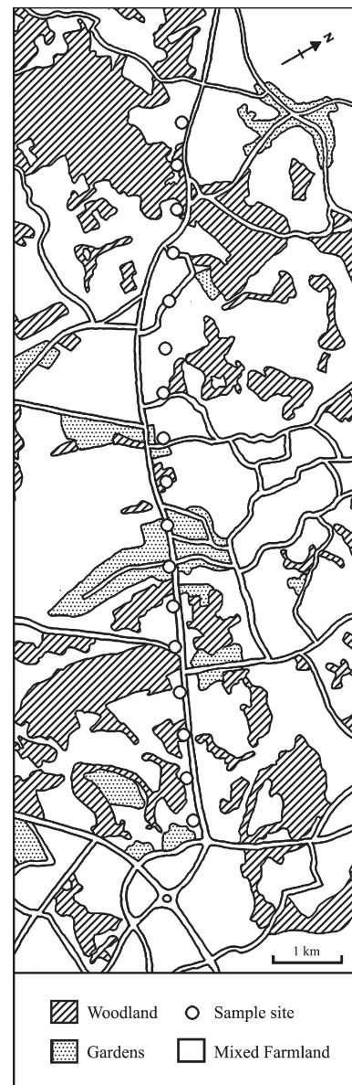
Fig. 1. A map of the study area indicating the location of sample sites and major habitat areas.

During July 2001, individuals of Bombus terrestris and B. pascuorum were collected from 17 sample sites spaced 625 \text{ m} \pm 20 \text{ m} apart along a straight 10 km transect (50:57:12N, 1:32:14W to 50:59:55N, 1:39:39W). The transect passed predominantly through mixed farmland, with some areas of woodland and gardens (Fig. 1). Ten kilometres represents the theoretical maximum range over which bumblebees can forage and return with a net profit (Cresswell et al. 2000), and also the maximum