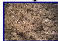
Sample dry (65 °C)