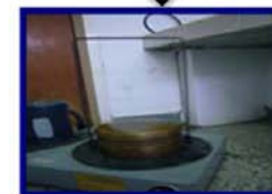
Sieving (150 micrones)