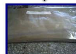
End product (Flour of content ruminant)