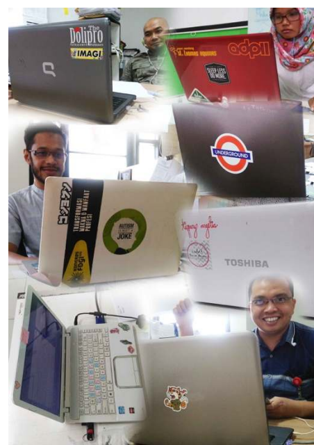
Figure 1 The Usage Stickers on Laptop in Telkom University

of “Attractive, Colorful, and Fun” Because of their prefabricated laptops are way too boring for them?