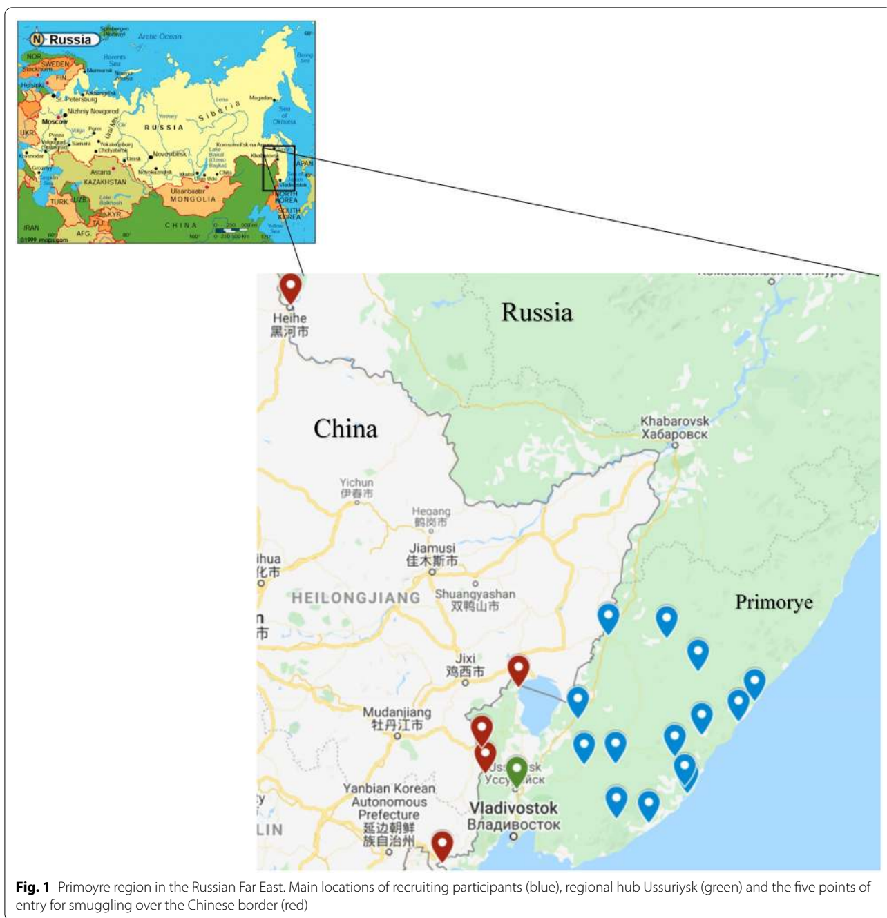
Fig. 1 Primorye region in the Russian Far East. Main locations of recruiting participants (blue), regional hub Ussuriysk (green) and the five points of entry for smuggling over the Chinese border (red)

a deep analysis of a social world from the members’ perspectives and to maintain the integrity of the phenomenon in question. The shorter time frame can be justified in part by the length of time poachers are accessible in the taiga during the Russian winter, as well as the nature of my research—I had prior knowledge that Russian authorities did not want this research project moving forward, which became a reality when I was pursued by the FSB (Russian Secret Service). Although I was deported from