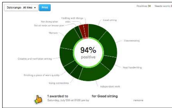
Figure 2. Example student's badges across time (name removed to preserve anonymity).

Having described classDojo, it is important to mention that this technology represents the virtual reward component of gamification and does not address other game elements such as rankings or leaderboards [15]. While virtual rewards are a critical part of gamification and this approach mirrors similar applications of gamification in the education domain [9, 14, 17, 26, 30], it only allows us to understand one facet of “gamification”. However, focusing on virtual rewards has particular significance within our case since teachers often motivate students with dyslexia with frequent praise of their achievements [38]. Compared to the traditional equivalent of awarding stickers, classDojo virtual badges offer several benefits. Whereas producing customised stickers is possible, it is time consuming. We postulated that classDojo would enable teachers to instantly and iteratively create badges potentially opening up the space for creative uses of rewards. Moreover, we expected that the points awarded under the badges would offer a historical archive of a child's learning progress. In contrast, stickers can be misplaced or forgotten (e.g. as students change workbooks) as a result limiting the student's ability to view how many stickers have been awarded and what they were rewarded for.