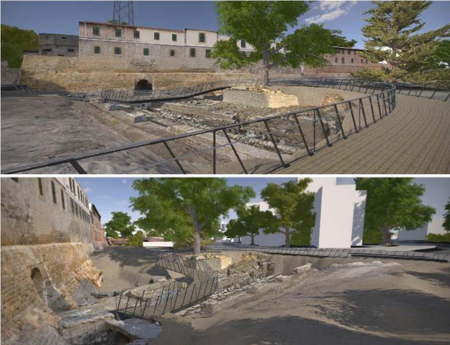
Fig. 1. The post-excavation management of the archaeological site of Paphos Gate in the historic core of the last divided capital of Europe, Nicosia, has been developed in line with the concept of cyberpark. It integrated spatially-distributed narratives and exposed users to interpretations of these data (as shown by Fig. 2). The research team devised a real-time interaction platform that aimed at the reintroduction of the archaeological site in the everyday life of the neighbourhood. Expected completion of construction works: February 2018.

communication interfaces, can serve as a vehicle to empower users. In this approach visitors and citizens of the city, as well individuals and communities that may be excluded could be enabled to raise their voice and participate in the future development of the POS (Páez and Darren 2005). These technological solutions are built on conceptual devices for individuals' entanglement with space through goal-oriented activities, such as gamification (Atkinson and Willis 2009), playful engagement and serendipity (Wetzel et al. 2011).