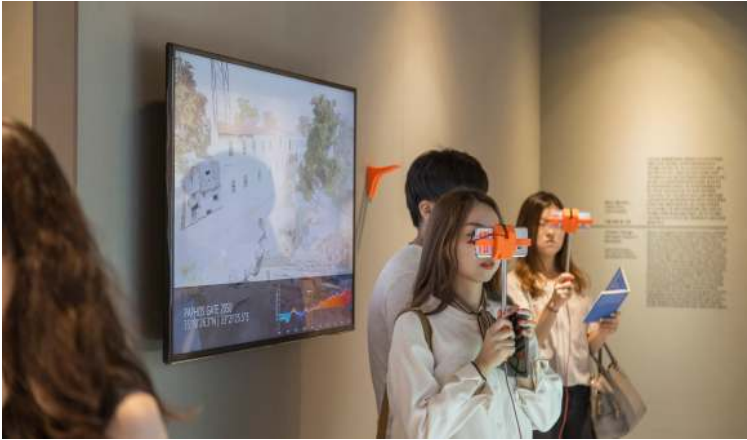
Fig. 2. Using mobile ICT is a low-budget solution of user engagement in meaningful interpretations of real-time data associated with a POS. Paphos Gate cyberpark was exhibited at the Seoul Biennale of Architecture and Urbanism 2017, titled “Imminent Commons”, convened on the thematic of nine Commons in 50 cities.

false sense of accessibility to what is actually a representation of the city as a (cybernetic) machine, and the notion of acquiring a lightweight control over the city’s non-interpretible complexity.