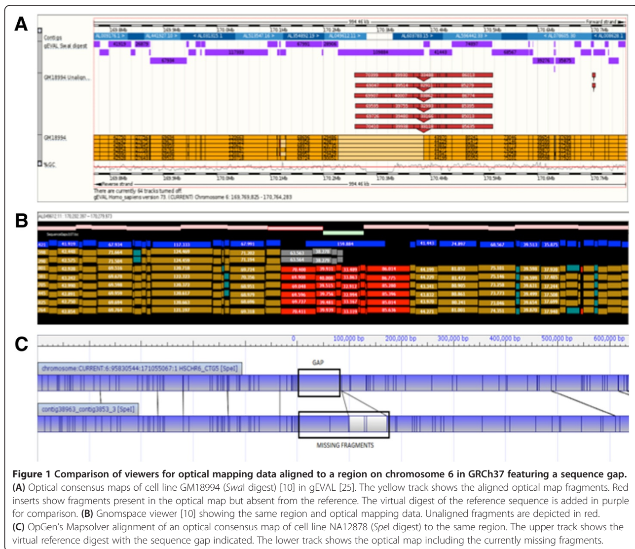
Figure 1 Comparison of viewers for optical mapping data aligned to a region on chromosome 6 in GRCh37 featuring a sequence gap. (A) Optical consensus maps of cell line GM18994 (Swal digest) [10] in gEVAL [25]. The yellow track shows the aligned optical map fragments. Red inserts show fragments present in the optical map but absent from the reference. The virtual digest of the reference sequence is added in purple for comparison. (B) Gnomspace viewer [10] showing the same region and optical mapping data. Unaligned fragments are depicted in red. (C) OpGen's Mapsolver alignment of an optical consensus map of cell line NA12878 (SpeI digest) to the same region. The upper track shows the virtual reference digest with the sequence gap indicated. The lower track shows the optical map including the currently missing fragments.

The complete optical maps for human and mouse have been imported for display in the Sanger Institute's Genome Evaluation Browser gEVAL [25]. This integration facilitates the assessment of regions of interest through comparison between each optical map cell line and the wealth of other data the browser offers, such as BAC library end sequence alignments, cDNA alignments and comparison to other assemblies. This gives both GRC genome curators and external users the ability to see all the available evidence in