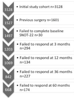
Figure 1. Flow diagram of patient recruitment and final study cohort.

a MCID improvement at 3-months reported a deterioration of at least one MCID (ie. 9 points) from the 3- to 12-month SNOT-22 score. Deterioration in the SNOT-22 score greater than one MCID (ie. 9 points) from the 3- to 12 month SNOT-22 score after primary ESS was found to be a significant independent risk factor for revision surgery (OR 2.7 (95% CI 1.3 – 5.9); p=0.01). This indicates that even though a patient may have an overall MCID improvement at 12 months, compared to their preoperative baseline SNOT-22 score, they are at higher risk for progressing to need revision ESS if they demonstrate a 9-point deterioration in SNOT-22 score at 12 months compared to their 3-month score.