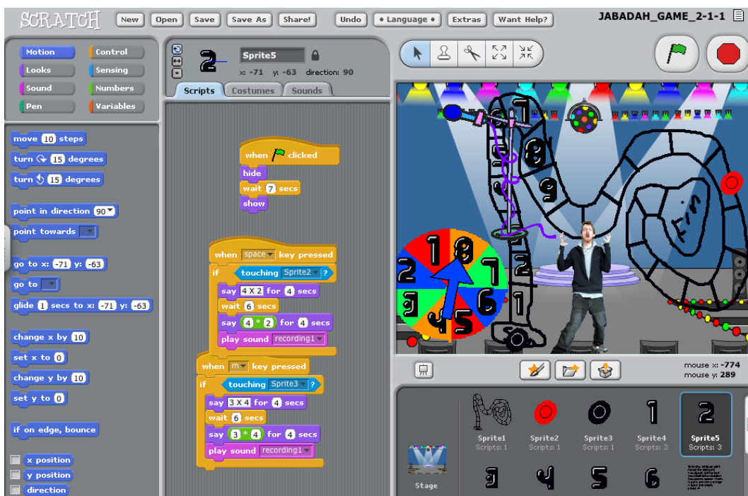
Figure 2. The group ‘Jabadah’s’ workspace as their game is in development.

They tried some options and considered the visual feedback resulting from each change in the coding. Through this, they were developing a sense of the relationship between the programming script they had selected and modified the measurements of, and the associated movement of the sprite on the screen. The next day they continued this relational experimentation by ‘using existing scripts to see how to manipulate things differently’. During this experimentation, they worked out how to design and operate a spinner (see Figure 2). When they reached a point of uncertainty they used a ‘predict and check’ approach. They reflected on the outcome, before refining their evolving script. This involved further relational thinking, as recorded in the written observations, they ‘looked at how the different scripts affected the action of the sprites’ and ‘experimented with the number scripts in their own project, by putting in variables and then running the script to see what would happen.’ They could see the relationship between the modification of the script and the movement of the sprite. They were able to generalise this relationship and predict the likely movement of a sprite given the change to the programming script. This illustrated a development in their relational thinking as they became more effective at predicting the outcome of their changes to their script.