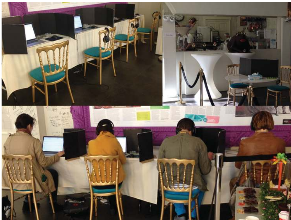
FIGURE 3 | Experimental booths prior to the experiment (top left), overview of the kitchen when entering the experimental area (top right) and overview of the experimental booths during the experiment (bottom).