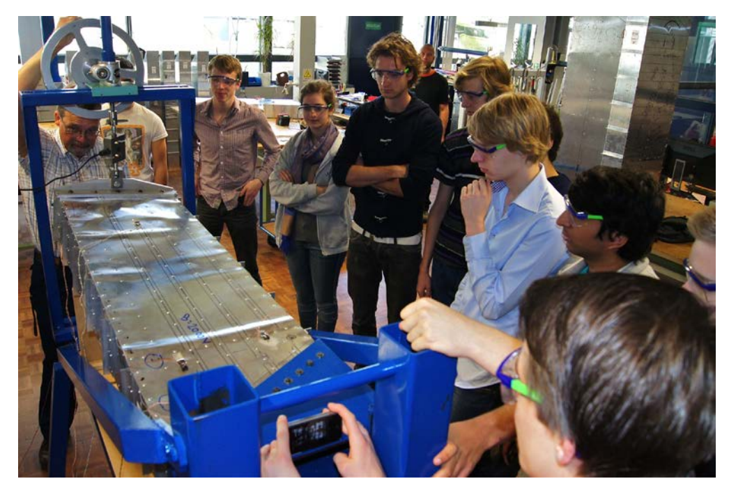
Figure 4: The wing box in its test rig with buckling clearly visible on the top panel

After the design presentation, the redesign phase starts. Students will design, produce, test and analyze two specimens. These specimens are a substructure compared to the wing box, as only compression specimens located on the top of the wing box are to be designed. At the same time the level of difficulty of this design is increased as more design freedom is given and the students need to experiment more with what formulas are most suitable for this design. This design is then also tested as can been seen in figure 5.