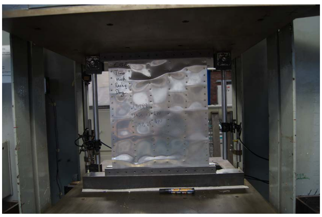
Figure 5: the redesigned top panel in its test rig

After the design presentation, the redesign phase starts. Students will design, produce, test and analyze two specimens. These specimens are a substructure compared to the wing box, as only compression specimens located on the top of the wing box are to be designed. At the same time the level of difficulty of this design is increased as more design freedom is given and the students need to experiment more with what formulas are most suitable for this design. This design is then also tested as can been seen in figure 5.