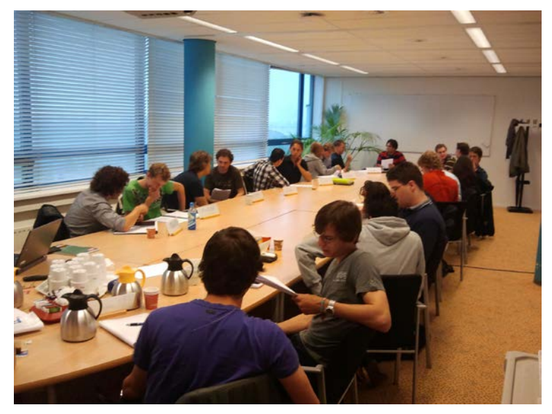
Figure 2: Picture taken during training of teaching assistants. The TA's are challenged to pick up the relevant information from a story read by a colleague.

cases other staff members join to answer particular TA questions about the work package contents. Prior to the start of the project the TA's follow a one day training dealing with the specifics of team coaching such as observing, listening and motivating (figure 2).