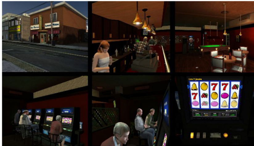
FIGURE 2 | Illustrations (screenshots) of the At Fortunes virtual environment used in all three studies. Reproduced from Bouchard et al. (18) under the Creative Commons copyright licence.

The data were analyzed with two conditions (frequent gamblers experimental condition vs. occasional gamblers control condition) by four repeated measures (Scrabble™—game of skill control condition, real VLT control condition, immersion in the At Fortunes virtual bar with VLTs experimental condition, immersion in the The 3Dice virtual casino experimental condition) ANOVAs conducted separately with each subscale of the GCS. A Bonferroni correction was applied to control for inflation of the error rate due to multiple comparisons