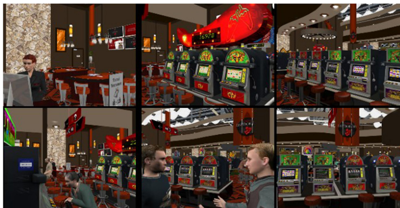
FIGURE 3 | Illustrations (screenshots) of The 3Dice virtual environment used in all three studies.