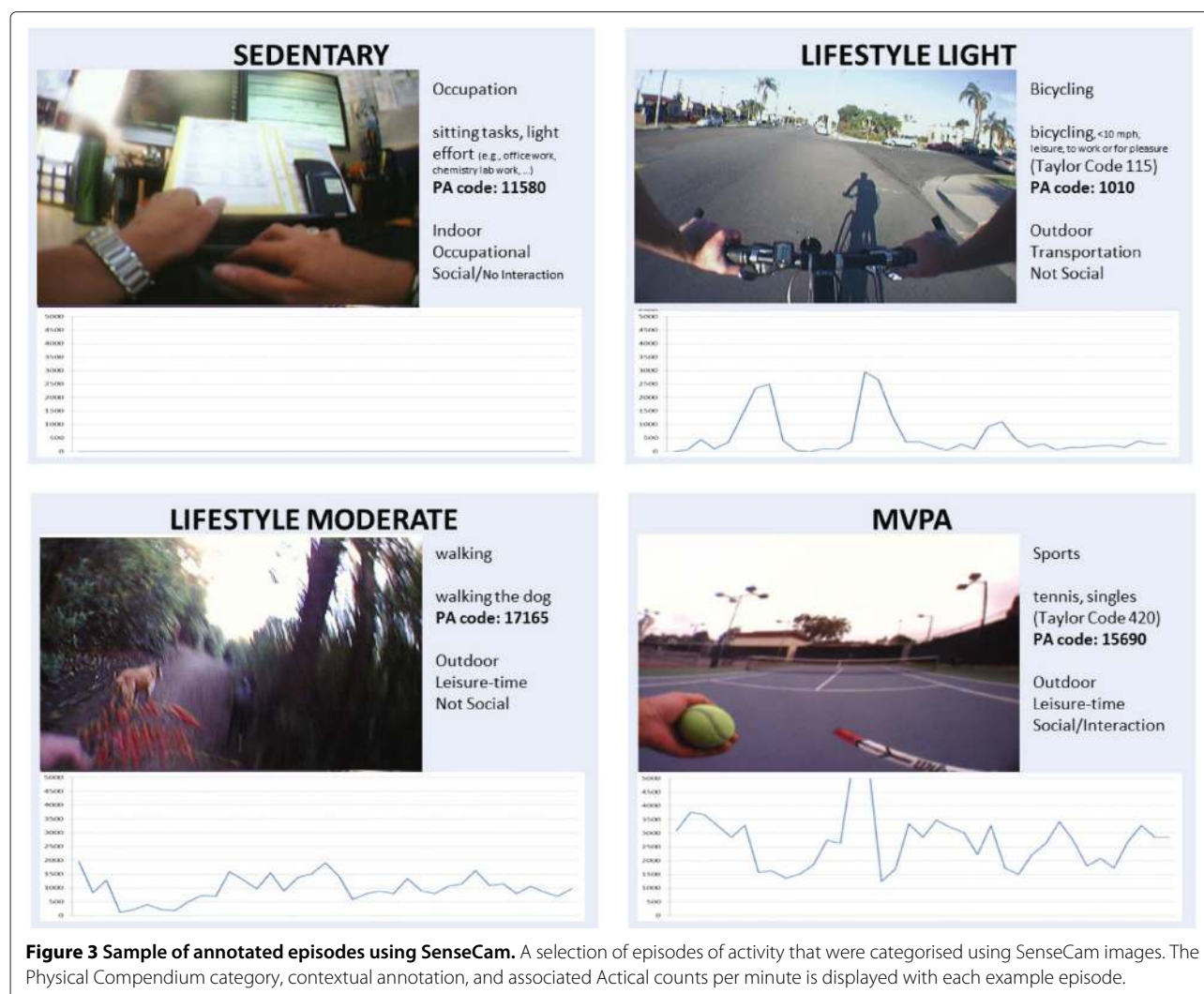
Figure 3 Sample of annotated episodes using SenseCam. A selection of episodes of activity that were categorised using SenseCam images. The Physical Compendium category, contextual annotation, and associated Actical counts per minute is displayed with each example episode.

a better understanding of determinants driving physical activity behaviours.