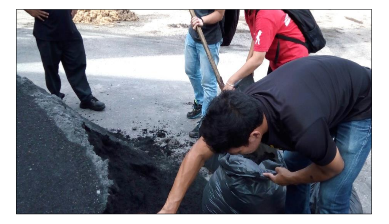
Figure 2. POFA in open air