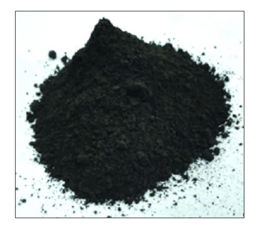
Figure 3. Grinded POFA