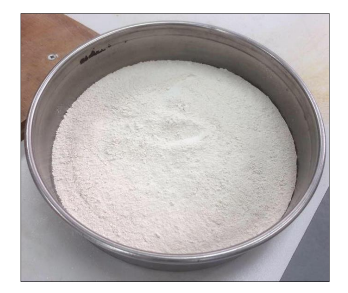
Figure 1. Finely grinded ESP