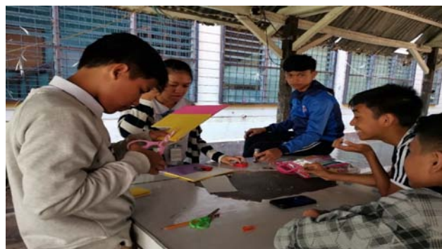
Figure 3. Students working together to finish a project

As shown in Figure 3 and Figure 4, students' are working collaboratively in small groups towards a common goal, and that is to solve a problem and to finish a project. The collaboration of students would also mean attending group meetings regularly, contributing ideas to group discussion, completing assignments on time, preparing work in a quality manner, and demonstrating a cooperative and supportive attitude. It is noted that students appreciated the quality of working relationships, the independent way in which group work was facilitated, and the chances for freedom of action and thought [20]. This is due to the real-life activities and ample time that was given to the students to solve problems and create projects. Likewise, among the five fundamental elements involved in collaborative learning, students who are utilizing PrBL and PjBL developed individual and group accountability, group processing, interpersonal, and small group skills [21].