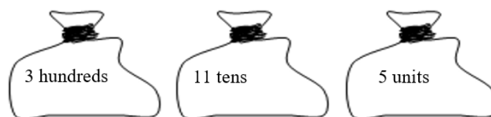
Figure 2. Item 10c from the translated test. (What number is in the bags?)