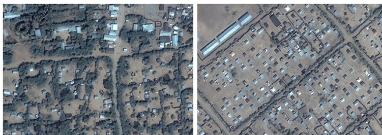
Figure 6 Sections of Kakuma camp.

imagery. Beyond these challenges, availability of cloud free images may be a serious constraint in some locations, particularly when a very short delay between the analysis and image time point is needed (i.e. in dynamic, evolving situations): for example, in DRC we excluded several candidate sites for analysis because no cloud free images were available.