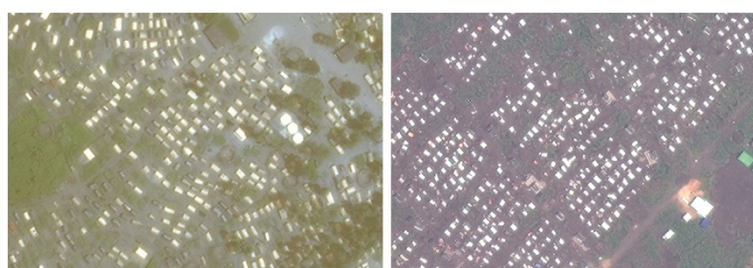
Figure 3 Sections of Bambu (left) and Mugunga III (right) camps.

As shown in Table 5, the total person-time required to implement the method fully was reasonably consistent across sites, ranging from 16 to 42 person-hours, i.e. about 2 to 5 working days of a single analyst. Most person-time (47%) was devoted to searching for occupancy reports. Preparing images and counting structures took up 17% and 24% of the total person-time, respectively. Counting time per capita population was also fairly consistent, ranging from 0.19 to 0.51 hours per 1000