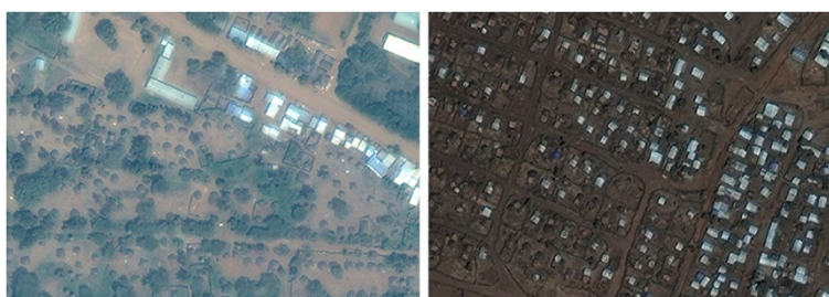
Figure 4 Sections of Sherkole (left) and Shimelba (right) camps.

population (mean 0.30): accordingly, a site of 100,000 people might be projected to require about 30 hours.