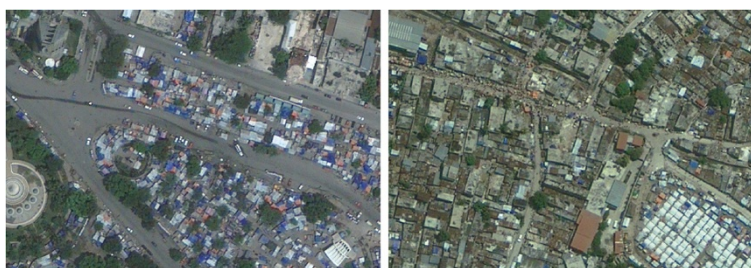
Figure 5 Sections of Champs de Mars camp (left) and Delmas 24, Sollino and Fort National neighbourhoods (right).

Visual analysis of the imagery was not overly complicated, despite most analysts in this study having no prior GIS skills. However, the visual quality and complexity of the image were critical determinants of both speed and accuracy of counting. While experienced spatial analysts may be able to improve image quality by using various techniques that enhance the visibility of features, we wished to evaluate use of the method by analysts with limited GIS skills, and thus refrained from making such improvements to the images. Moreover, in many instances the very typology and layout of structures (e.g. multiple walls, structures connected to each other and removal or abandonment of structures) imposed a limit on accuracy that, given the present resolution of commercially available imagery, is likely to remain to some extent intractable (see Conclusions). However, having four or more bands in the multi-spectral image did help in a few cases to distinguish between vegetation and man-made structures when the latter were constructed out of different materials, and we believe therefore that these options should always be selected when obtaining