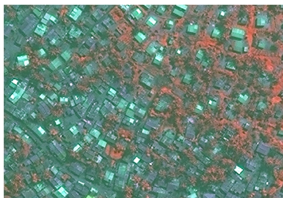
Figure 7 Section of Bairro Esturro.

The above drawbacks are partly a result of our choice to investigate a simple, manual method designed to empower non-specialists to carry out population estimation. Automated counting methods would necessitate a far higher skills level and thus require input by centres of excellence in remote sensing. While a review of automated or semi-automated methods is beyond the scope of this paper, this is an area of vibrant research, and we believe that these methods have a considerably larger potential for improvement than manual analysis. Automation would prove particularly valuable in scenarios where population estimates need to be updated frequently to track displacement dynamics, and could perhaps provide a solution for urban areas in which the manual method may never perform as accurately as needed.