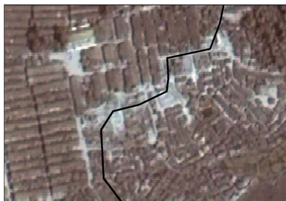
Figure 1 Sections of Kutupalong official (left of black line) and makeshift (right of black line) camps.

The search strategy yielded few eligible reports, ranging from only one to 11 per site (Table 4). A total of 38