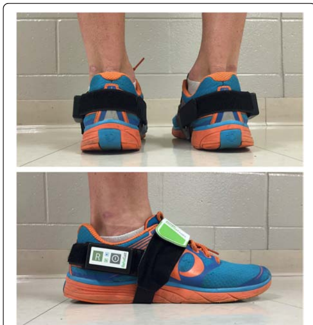
Fig. 1 Photograph showing the sensor placement on the lateral aspect of subjects' personal shoes

All statistical analyses were carried out in SPSS Version 22 (IBM Corporation, Amonk, NY). Separate 2 (device: RehaGait® vs. treadmill) × 3 (speed: normal vs. slow vs. fast) × 2 (slope: flat vs. inclined) × 2 (time: day 2 vs. day 1) fixed-factor linear mixed models were conducted for speed, stride length, cadence and stride time. Bonferroni