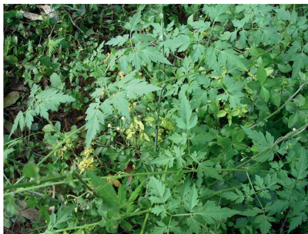
Figure 7 'Mudakkathan' ancient remedy for 'Moottu vadham' (rheumatoid arthritis).

supplement for some families from impoverished communities of third world countries. The paradox is that Cardiospermum halicacabum is a poisonous (contains cyanide) invasive plant that agricultural researchers have described as a noxious weed that must be globally eradicated. We are currently investigating genetic variation among the haplotypes of Cardiospermum halicacabum and the complex cryptic taxonomy, which consists of several ethnotaxa.