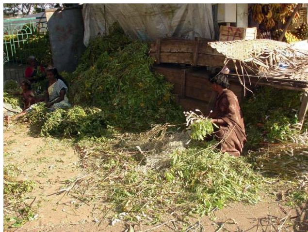
Figure 4 Collections of ethnobotanical plants (Kannupila, Pannaipoo, Veppan, Avarai and Nochi etc.) for sorting and distribution within the community or trading with other communities.

part of the Irulas health concept in which healers insist on having plants as part of their diet to maintain good health. The general health category included the largest number of taxa, reports of utility and a relatively high level of consensus (Table 2). We found in our survey that some of the plants used in the general health category are edible to the Irulas (8 species), while others were non-edible (19 species) (Table 3). The great variety of plants that are collected from the wild and distributed among the community (Figure 4) or sent off to local markets for trading with other communities (Figure 5). An ancient tradition of the Irulas is to eat certain plants on a regular basis according to the seasons in order to prevent certain diseases. It is a common practice for the Irulas to consume plants in the wild throughout their daily routine. While hunting, the Irulas grab leaves of Capparis zeylanica L. and eat them fresh to stimulate their hunger and increase their