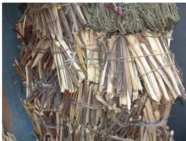
Figure 5 Bundles of ethnobotanical plants (Nagarasi, Veeraii, Thillai, Vellerugu, Thazahi, Vagai etc.) stored and traded for use as ethnomedicine.

desire to hunt. This plant is also served as an appetizer prepared as a dipping paste with pepper, tamarind and garlic. While trekking through the forest the Irulas would pick leaves to eat or chew on young tree branches; the forest is a natural pharmacopeia/grocery store for them.