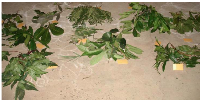
Figure 2 Sorting of ethnobotanical plants by the informants.