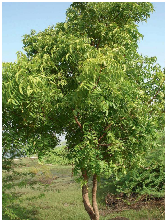
Figure 8 'Veppam' is collected as a bunch of twigs tied in a bundle and placed above every household doorway to keep away evil spirits.

The Irulas are also strong believers in spiritualism for which they utilize many plants. Although we will not report in detail plants used for spiritual reasons it is important to note that there was high consensus ( F_{ic} = 0.91 ) among the informants for this utility category. We will briefly describe one application. We noticed that above every household doorway are a bunch of twigs tied in a bundle. This is 'Veppam' ( Azadirachta indica A. Juss.; Figure 8) and it is used to keep away evil spirits. Similarly,