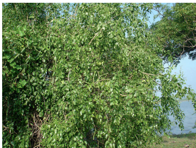
Figure 6 'Vagai' and ancient remedy for 'Moottu vadham' (rheumatoid arthritis).

The Irulas treat 'Moottu vadham' (rheumatoid arthritis) with at least two different ethnotaxa, including 'Vagai' (Figure 6) and 'Mudakkathan' (Figure 7) both of which have a high consensus factor for the Irulas ( F_{ic} = 1.0 ) within this study and by Malasars ( F_{ic} = 0.78 ) [37]. The Malasars treat rheumatic pain using two other plants, Diplocyclos palmatus (L.) C. Jeffrey and Boerhavia diffusa L. [37]. We identified 'Mudakkathan' to be Cardiospermum halicacabum L. sensu lato ('balloon vine') and 'Vagai' to be Salvadora persica L. Previous research by Ragupathy [42] revealed a complex taxonomy of several ethnotaxa for 'balloon vine', which has many associated utilities, including a remedy for joint pain. In many cultures this plant is harvested in backyards for both medicinal and food value. In fact, it provides an income