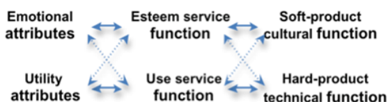
Fig. 1. Connections between attributes and functions

Summarizing, we may establish connections between attributes and service functions, and between service functions and product functions, as in Figure 1. Examples of these types of attributes and functions will be provided ahead.