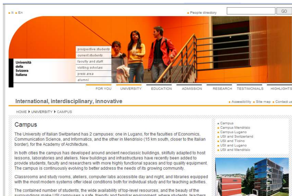
Figure 2. A content page prototype for the new USI website.

The choice of the thematic picture on top of the pages, which is different for each section, is for example guided by the need of evoking specific key values for a specific target. In Figure 2, a page of the section for “Prospect Students”, the top image should suggest the feeling of a “Friendly and familiar” USI, and of a “friendly environment”.