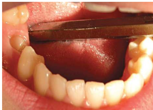
Figure 1. Intraoral view of the patient. Note that only a small cusp of right mandibular 1 st molar can be seen.

In order to assess the position of the inferior alveolar canal and the relationship between the canal and second premolar a coronal, CT was taken (Philips Tomoscan, Netherlands). CT scanning of the mandible consisted of 26 slices with a thickness of 3mm and 1mm slice gap. Relationship of inferior alveolar canal and impacted premolar can be observed in Figure 4. Furthermore the amount of bone volume of the involved section and symmetrical section (to compare the bone volume) calculated from the slices on post processing screen of the system. The bone volume was 8.46cm 3 on the right side compared to 12.75cm 3 on the opposing side which demonstrated that the structural weakness could arise, if molar, premolar and primary second molar were extracted. This could lead to long term problems such as potential pathological fracture