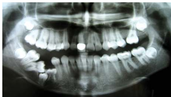
Figure 2. Panoramic radiography of the patient.