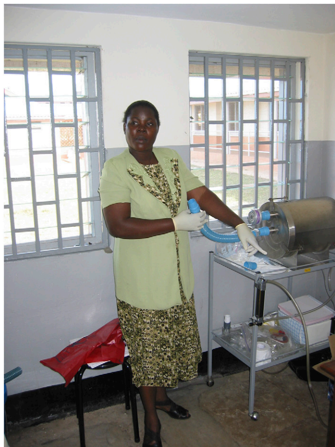
Figure 1. Cough Aerosol Sampling System. View inside of chamber with two Andersen cascade impactors and settle plate (left) and set up in procedure room ready for use (right).