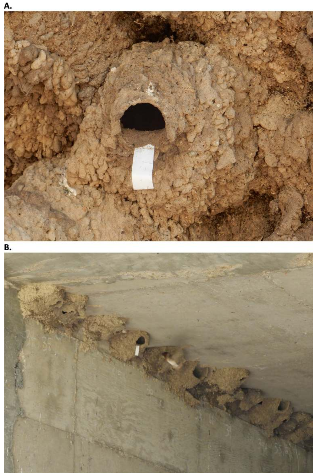
Fig 2. Marking tape (novel object) placement on a cliff swallow nest as used in neophobia trials measuring latency to enter nest and number of attacks. (A) Marking tape on a nest and (B) a cliff swallow hovering to the right of its nest.

https://doi.org/10.1371/journal.pone.0226886.g002