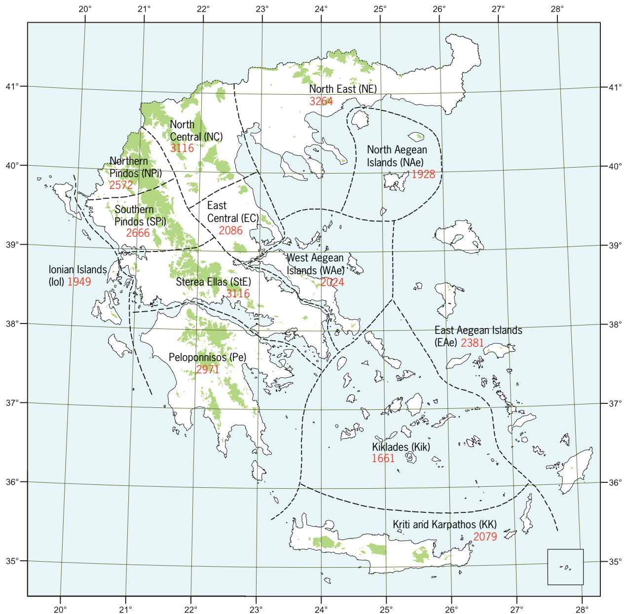
Fig. 1. Vascular plant species in each of the 13 floristic regions of Greece.

descending order. The floristic regions of NPi, KK, WAe and IoI each have the same number of families (146 families) (Table 2).